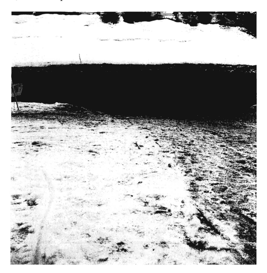
Ex. 46; 5/20 RP at 127-31. In short, The Mountaineers created a hazard by grooming the access trail and removing the snow berm at the base of the trail and then failed to take reasonable steps to eliminate that hazard. 5/20 RP at 119-20. This approach to the safety of its customers, according to Dr. Gill, was "grossly inadequate." Id. at 148.

Unfortunately, The Mountaineers did not do any of these things. As a result, the access path looked like this: