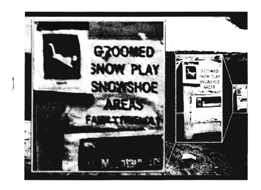
Ex. 49; 5/20 RP at 140. Further up, there was a similar sign: